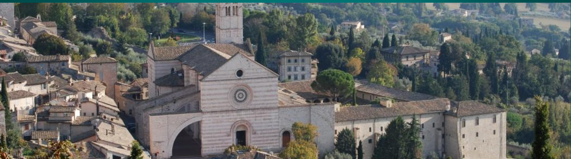
Basilica of St. Clare, Assisi