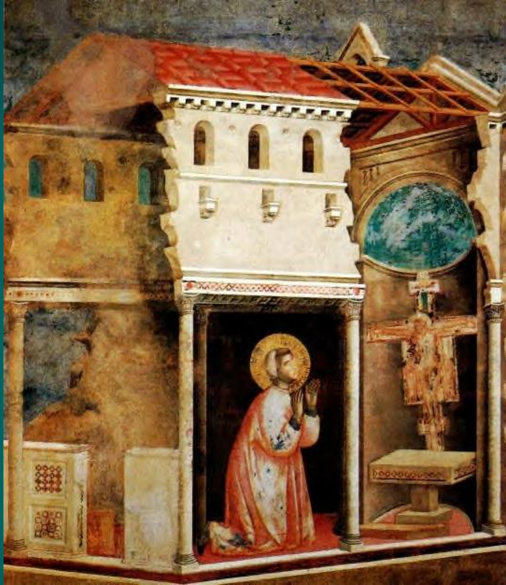
Giotto (Upper Basilica of St. Francis) (1297-1299)