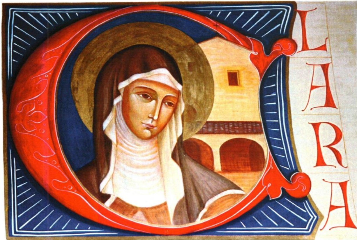
Original Artist Unknown

Clare begins her order of the Poor Ladies at San Damiano